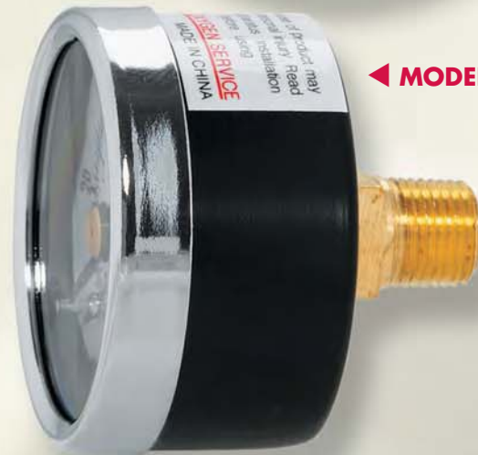
◀ MODEL 15TC